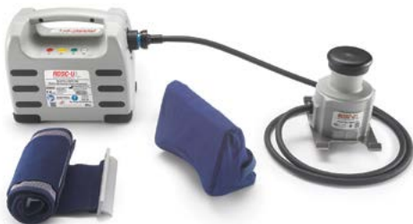
A03-01-000 ROSC-U™ Mechanical CPR System