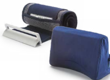
A02-58-134 Disposables Pack - 10 each of: • Torso Restraints • Head Stabilizer Covers