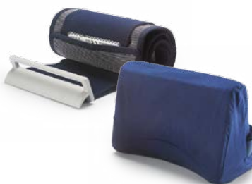
A02-58-134 Disposables Pack - 10 each of: • Torso Restraints • Head Stabilizer Covers