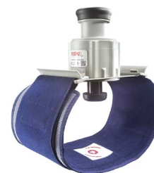
A02-60-134 Disposables Pack - 5 each of: • Torso Restraints • Head Stabilizer Covers

For pricing contact your authorized ROSC-U™ distributor.