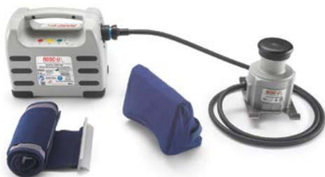
A03-01-000 ROSC-U™ Mechanical CPR System